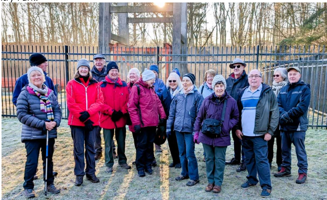
18 Happy Wanderers

It was a cold but crisp sunny day which was perfect for winter walking. We began with a fairly short section of urban walking along Bestwood Road before crossing the A611 Hucknall Road to reach the Robin Hood Way footpath, which eventually led to a photo opportunity at the Winding House in Bestwood Country Park.