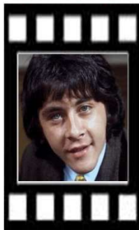
Richard Beckinsale Born in Carlton

A SELECTION OF TV & FILM CLIPS AS A CELEBRATION OF THE LIVES OF WELL - KNOWN LOCAL ACTORS