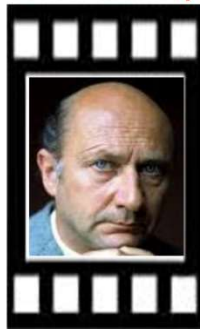
Donald Pleasence Born in Worksop