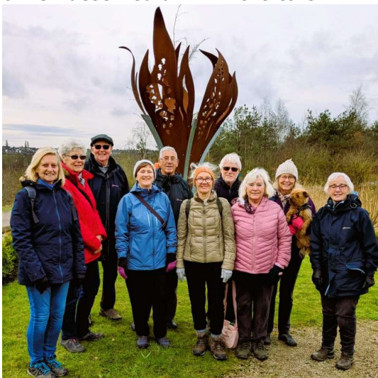
Smiling walkers standing near the miners memorial

At the end of the walk we enjoyed a well-deserved drink in the café.