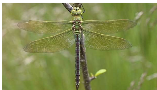
Female emperor dragonfly

They are to be found in all wetland areas throughout the summer months.