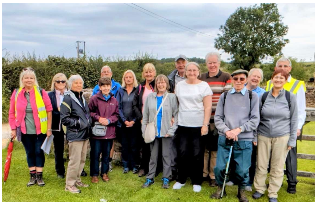
Our next walk is on Thursday September 21 st – no walk in August