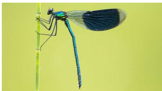
Male banded demoiselle damselfly

Dragonflies are larger and more robust, with eyes that meet in the middle of their spherical head. Their front wings are narrower than their hind wings and when resting both pairs are held wide open