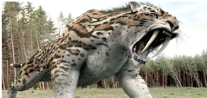
An image of an extinct Sabre Tooth Tiger