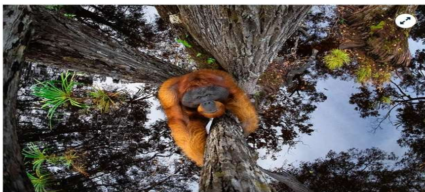
Bornean orangutan ( Pongo pygmaeus ) Tanjung Puting National Park, Borneo Thomas Vijayan