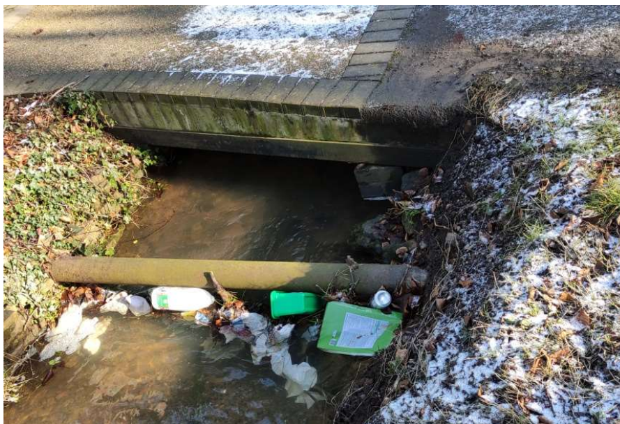
Litter which has been deposited in Linby Brook

When we are out cycling and walking no doubt like you we notice lots of litter in both urban and rural areas.